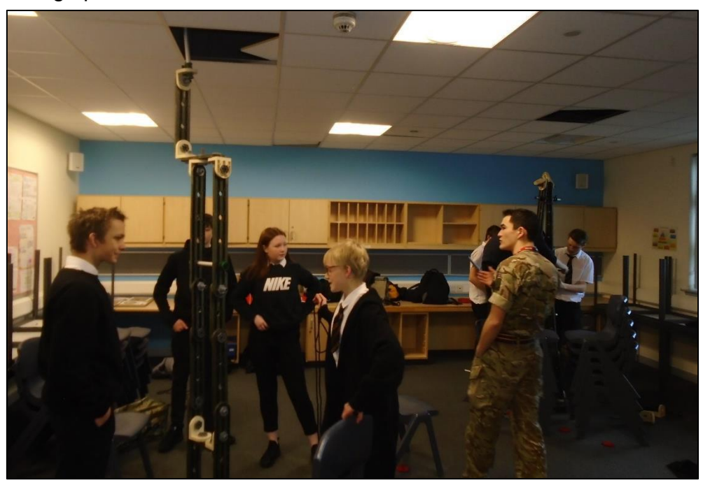
STEM Event General Information

If you have any concerns about the ScotXed data collections you can email the Head of Schools Analysis at <u>scotxed@scotland.gsi.gov.uk</u> or write to The ScotXed Support Office, Area 2D, Victoria Quay, Leith, EH6 6QQ. Alternative versions of this page are available, on request from the ScotXed Support Office, in other languages, audio tape, Braille and large print.