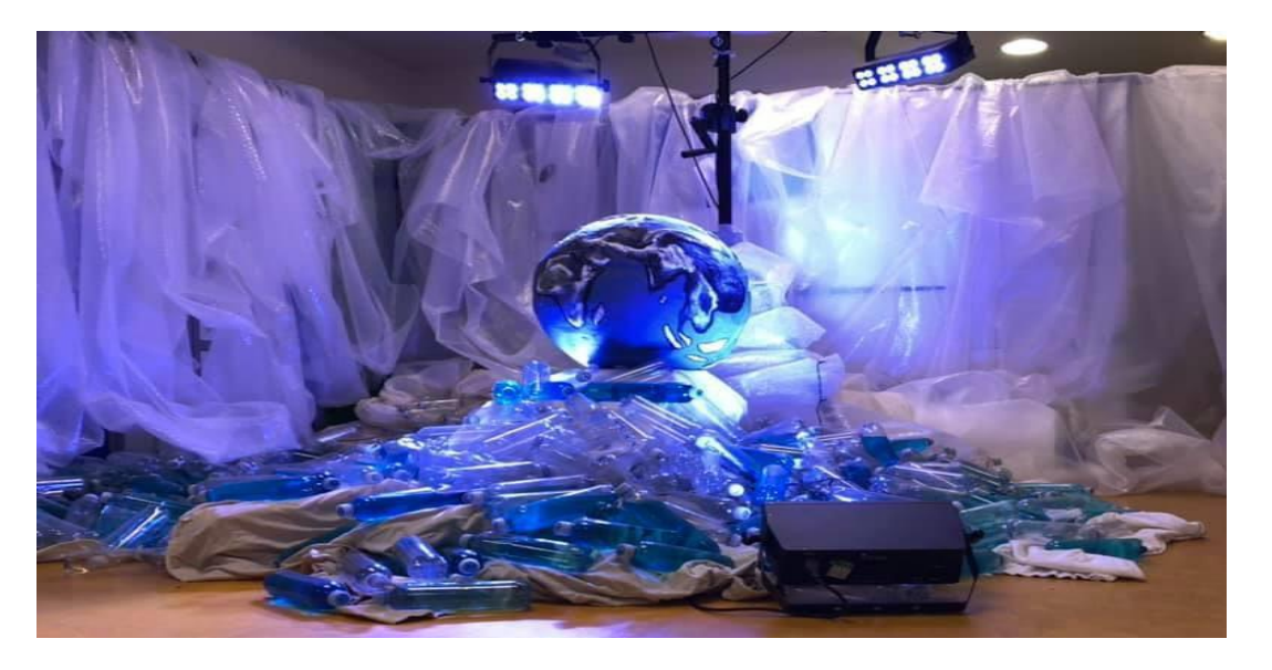
Our COP26 Art installation, which emphasises the single use plastic problem.

The Art Department is heavily involved in cross-curricular work and regularly liaises with other departments to work on specific projects.